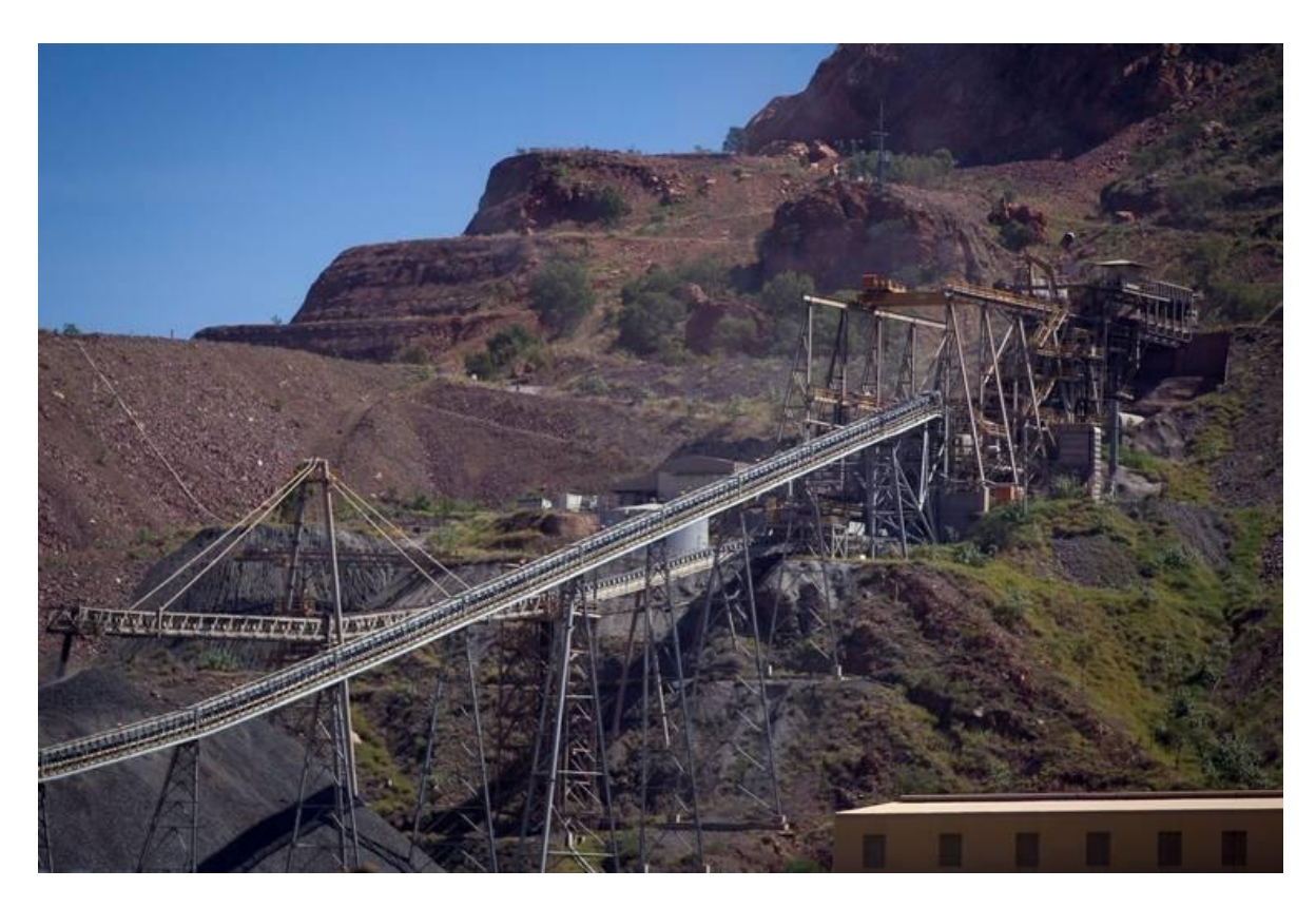
About 90% of the world's pink diamonds come from the Rio Tinto Argyle mine in Western Australia.

Trillions of dollars of stimulus from central banks and ultralow interest rates have helped push returns on many government bonds below zero, leading investors toward ever more esoteric assets. Top-end vintage car prices have increased nearly 460% in the past decade, while classic wine prices have risen around 240%, according to the annual Wealth Report published by London-based property broker Knight Frank. Prices of colored diamonds, the report adds, have risen 122% in the same period.